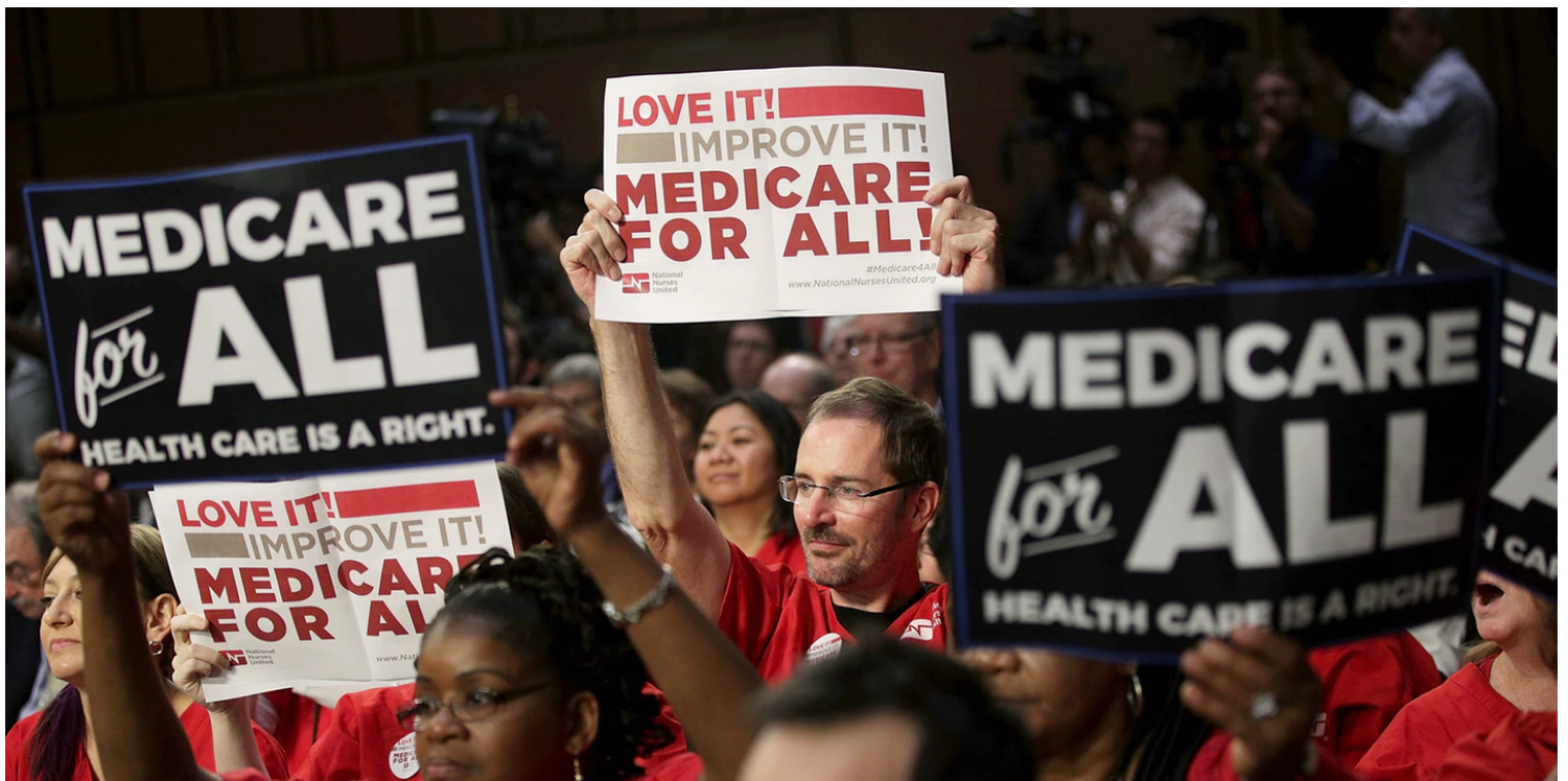
Supporters of Sen. Bernie Sanders hold signs during an event on health care in Washington D.C., on Sept. 13, 2017.

The Medicare for All legislation unveiled Wednesday by Rep. Pramila Jayapal, a Democrat from Washington state, was written with the help