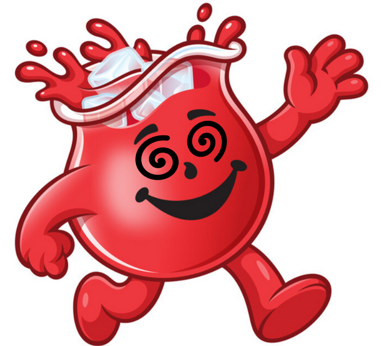
NATIONAL FEDERATION OF INDEPENDENT BUSINESS