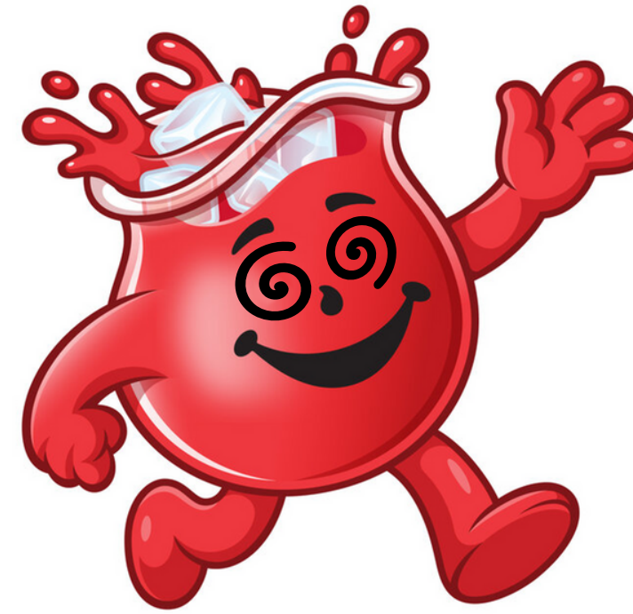
STATE AND LOCAL CHAMBERS OF COMMERCE